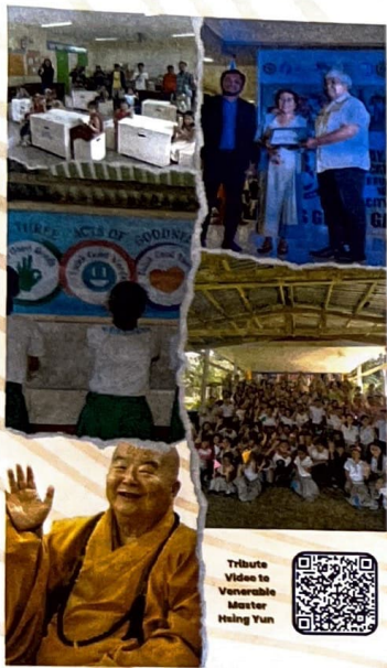
Tribute Video to Venerable Master Hsing Yun