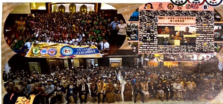
TAG SCHOOLS AND DIVISIONS IN THE PH THROUGH THE YEARS (2016- 2024)