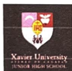
LEA LILIBETH B. EMATA, LPT