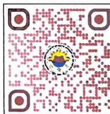
QR for Live-Out