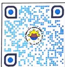
QR for Live-In

The said activity will accommodate participants on a first-come-first-served basis with a registration fee of Eight Thousand Eight Hundred Pesos (Php 8,800.00) for Live-In participants and Six Thousand Eight Hundred Pesos (Php 6,800.00) for Live-Out participants. Payment in cash or check shall be payable only to the Philippine Association of Records Officers and Archivists, Inc. (Strictly No Abbreviations) . To ensure that slots are held for interested participants, we would be very grateful if you could confirm your attendance ahead of time via the QR Code or the Link below.