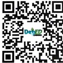
Project HANDA: School DRRM and Safety Readiness Tracker

Your immediate cooperation on this matter is highly appreciated.